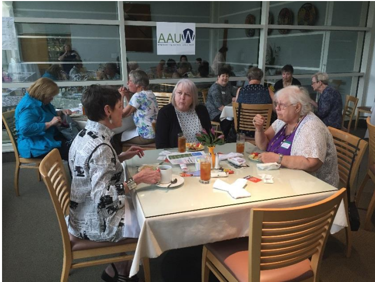
AAUW Little Rock NCCWSL Yard Sale, September 2017